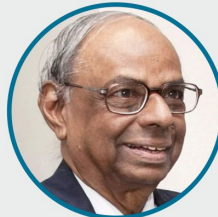
DR C RANGARAJAN former Chairman of the Economic Advisory Council to the Prime Minister and former Governor of the Reserve Bank of India